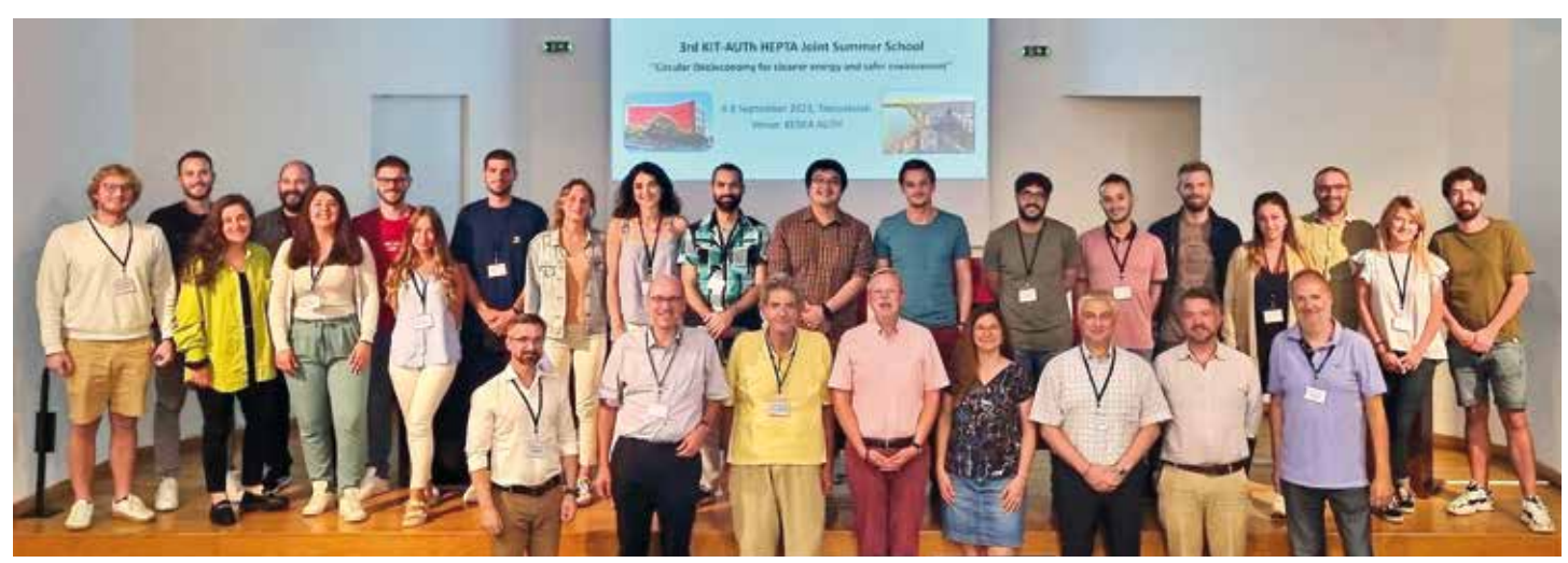
Participants of the third summer school in Thessaloniki in 2023.