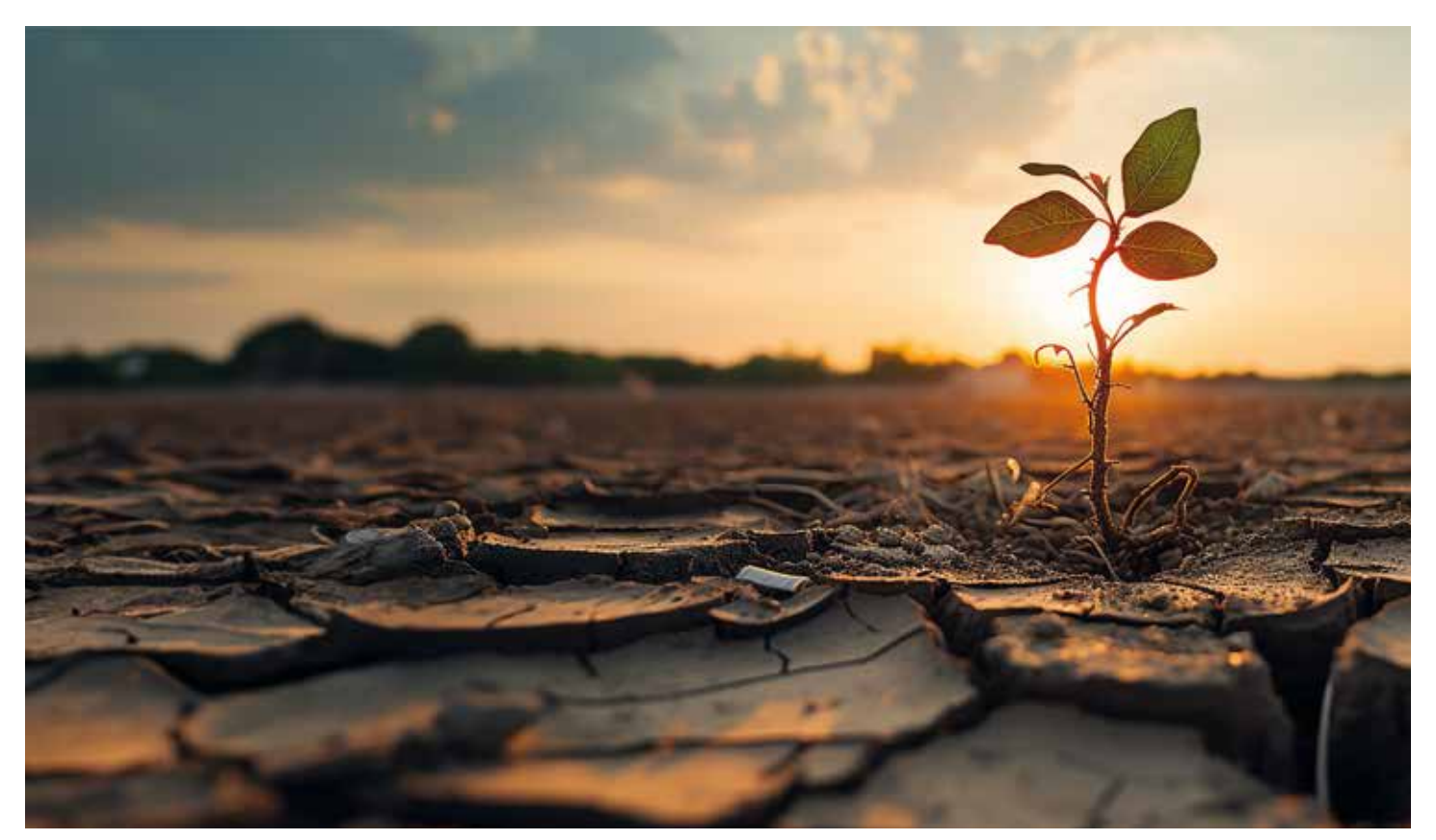
Intensive solar radiation strongly heats up deserts in subtropical zones.

More information: https://doi.org/10.1073/pnas.2220400120