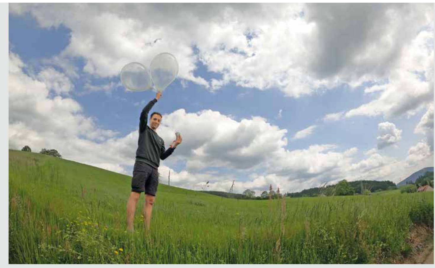
Exact weather forecasts and good scientific instinct allow helium-filled balloons to carry the measuring sondes directly into the storm cell.