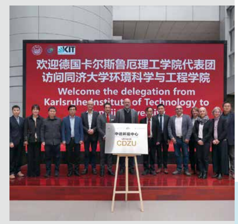
The ZKU delegation visiting Tongji University in Shanghai

Researchers visited Tongji University in Shanghai from January 9 to 12, 2024 in order to further develop the German-Chinese Environment Center. In addition to plenary discussions, in-depth bilateral talks, and laboratory visits, the program also included visits to potential industrial partners such as Bosch, Adidas, and Covestro. All of these companies have sustainability strategies and are working on circular economy processes and climate neutrality concepts.