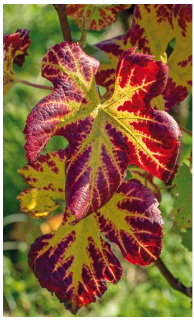
Salinity stress causes the leaves of the grapevine to turn red.

The task now is to find the responsible genes. This will then enable traditional plant cultivation in combination with moleculobiological analysis to provide more salt-resistant types of vine quite quickly: Certain molecular markers indicate which seedlings carry Tebaba's genes for salt tolerance. "This underscores the importance of biodiversity," says Nick. "We need the natural gene pool so that even on a heated planet we can still engage in agriculture."