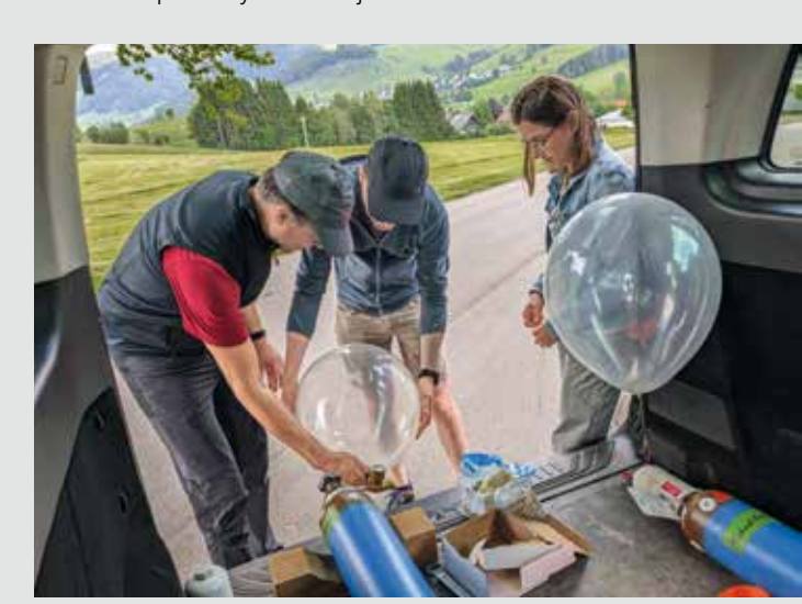
to investigate the growth of Transport balloons are filled with helium.

measurements in the summer of 2023, when the Swabian MOSES measurement campaign was also underway to collect extensive weather data. "The sum-