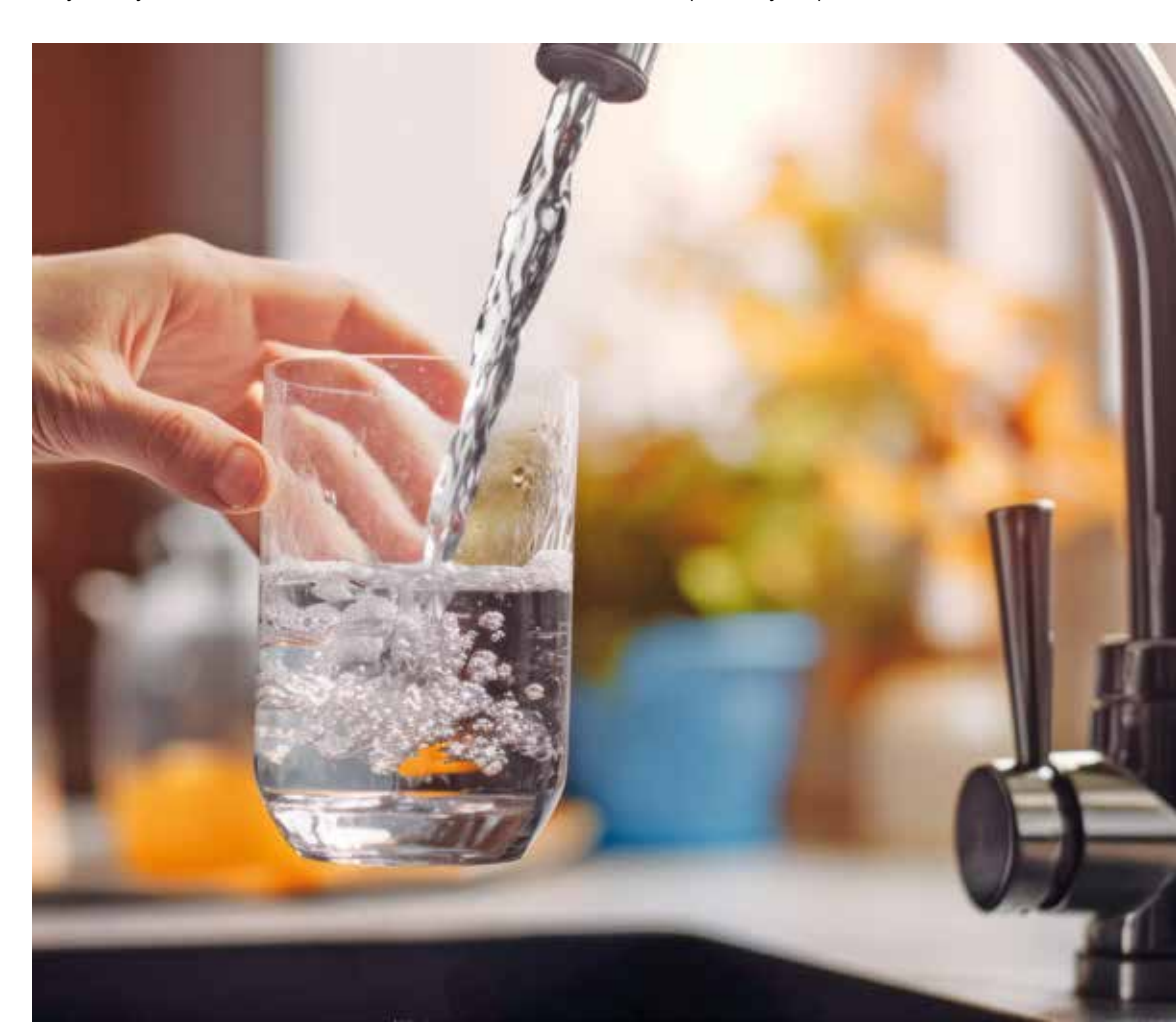
Drinking water: Too precious for the production of hydrogen.