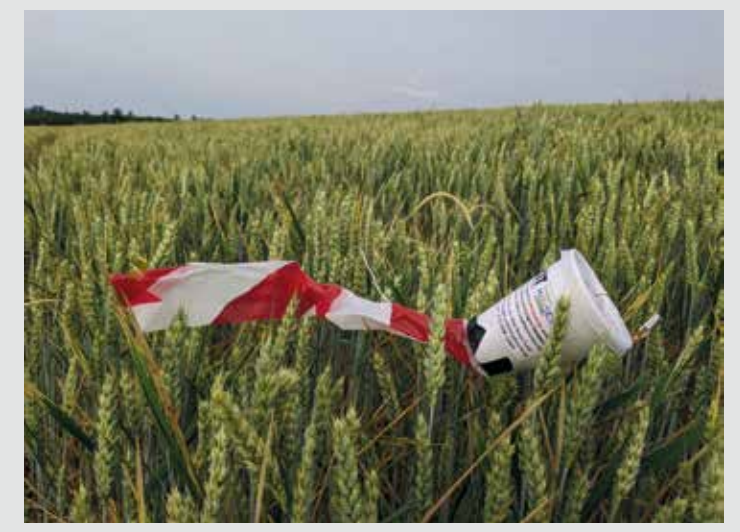
After deployment: The probes weigh only a few grams.

In the field, however, it is still up to the expert to bring the sondes to the center of the action. Dr.